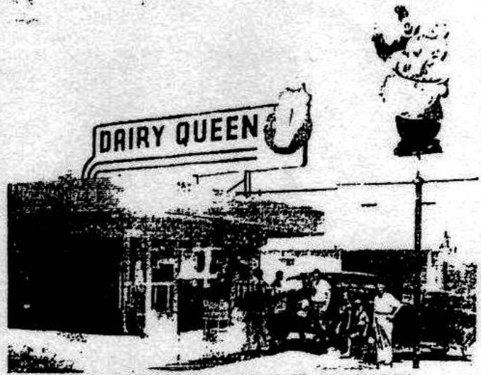
708 WEST GRAND — NEXT TO FIRE STATION RALPH & ZELLA SNIDER, Owners

WATCH THE SKY WEDNESDAY MORNING — "CURLY" WILL FLY OVER YOUR NEIGHBORHOOD